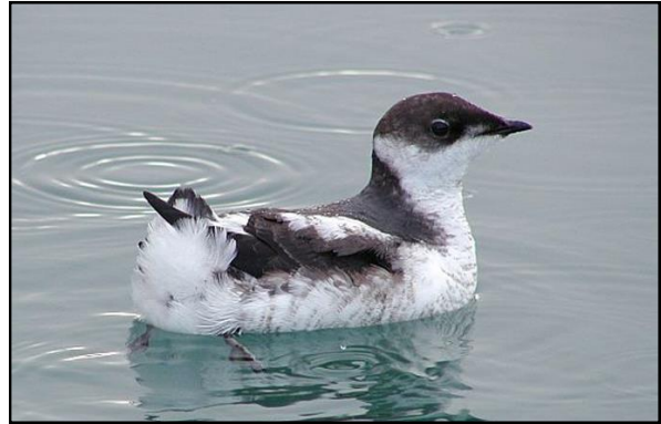
Marbled murrelet with winter plumage.

Washington’s populations occur mainly in northern Puget Sound, Strait of Juan de Fuca, and northern Pacific Coast. While at-sea distribution varies over time and location there is a general shift in winter abundance eastward from the Strait of Juan de Fuca to Puget Sound and San Juan Islands. In fall and winter, British Columbia populations move south to the Puget Sound.