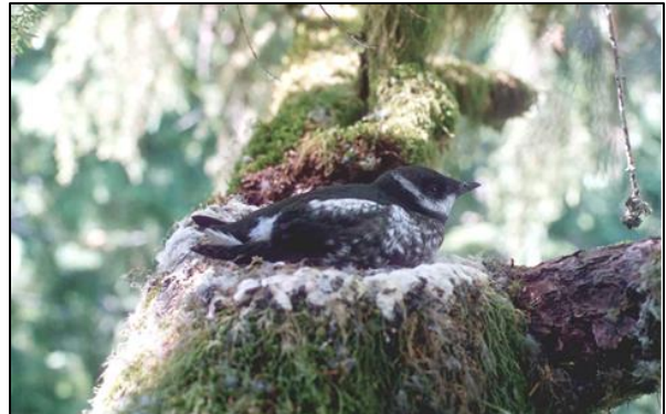
Juvenile (hatch-year) marbled murrelet just before fledging from nest.