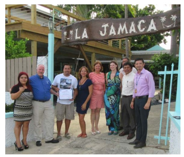
Estancia La Jamaca, La Parguera, Puerto Rico

The NWS Warning Coordination Meteorologist has the single signoff on the TsunamiReady Supporter Program -- not the state TsunamiReady Board (or equivalent).