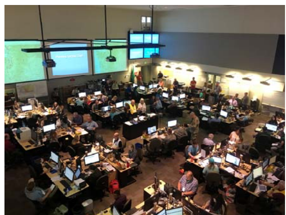
The state EOC is shown during the afternoon briefing on the first day of Cascadia Rising.

At North Beach High School in Ocean Shores, the Kentucky National Guard was deployed to conduct urban and wide area search and rescue. During a real disaster, the region will see help come in not just from local Guard units, but from across the country.