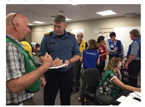
Multi-agency coordination in the Provincial Regional Emergency Operations Centre, Victoria, BC.

Overall, the exercise confirmed the need to get critical information out in a fast, effective way to communicate directly with the public. Building on our capabilities, increasing capacity, and expanding access to our tools with trusted agents are significant steps forward in increasing efficiency during an emergency.