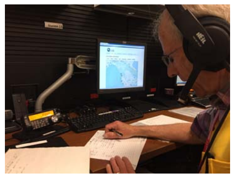
Volunteer amateur radio operators communicating with the local authorities to learn more about the mock earthquake, Port Alberni, BC.

intelligence and pushed out key messages for a few hours when our normal operations were compromised. Our radio communications officers were able to collect initial situational awareness information, and share the information along to our unit for further distribution.