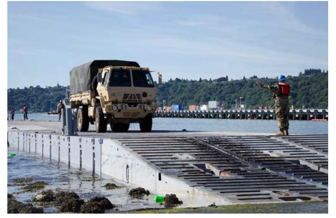
Soldiers from the Washington Army National Guard's 181st Brigade Support Battalion and U.S. Army's 7th Transportation Brigade load trucks during a Joint Logistics Over the Shore exercise at the Port of Tacoma in support of Cascadia Rising 2016 on June 5.

For the state Emergency Operations Center (EOC), the exercise helped agency partners figure out ways to communicate with people when cell phones don't work and the Internet is dark. There was heavy reliance on amateur radio operators, for instance. The state EOC, itself, was built on rollers and is expected to survive when a 9.0