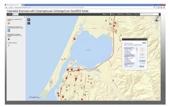
Clearinghouse Information Sharing – Arc GIS Online map updated in real time, with Clearinghouse Field Data, through XchangeCore GeoRSS feed, and XchangeCore connector.

2201 authorizes the California Geological Survey (CGS) to activate the Clearinghouse when conditions warrant. In addition, the National Earthquake Hazards Reduction Program authorizes establishing technical information clearinghouses within 24 hours following significant earthquakes in the United States. The CGS serves as the permanent, lead coordinating organization for the Clearinghouse in California, and manages the Clearinghouse in collaboration with the California Office of Emergency Services, U. S. Geological Survey, Earthquake Engineering Research Institute (EERI), and California Seismic Safety Commission. Clearinghouse activations traditionally have consisted of a physical outpost located near the earthquake-impacted area, but increasingly in both exercises and actual earthquakes, it employs advanced