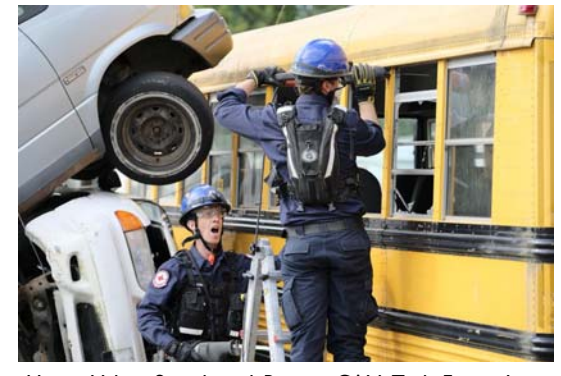
Heavy Urban Search and Rescue CAN Task Force I removes bus panel to save trapped children during Exercise Coastal Response.

During the exercise, EMBC tested elements of B.C's Immediate Response Plan, which lays the framework for the province's response to a catastrophic earthquake. As such, the EMBC Social Media Unit used a simulated social media platform to test its ability to share public information during the event's initial hours when power and telephone services were down. The unit used Twitter direct messages to reach a Kamloops-based BC Wildfire Service information officer, who in turn communicated critical first-steps to the public via EMBC's social media channels. From over 300 miles away, the information officer gathered