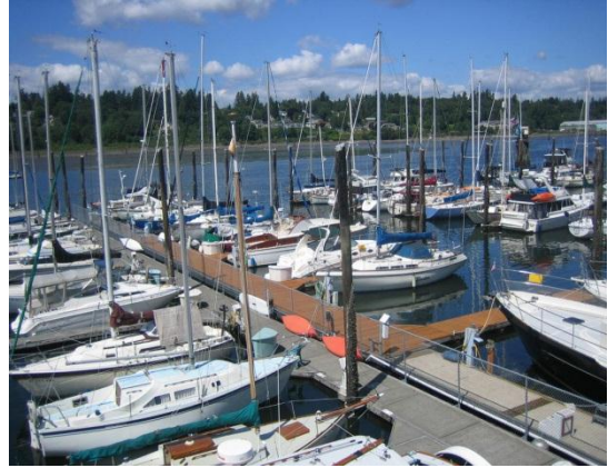
Fiddlehead Marina, Olympia.

Step 2: Complete the online Joint Aquatic Resources Permit Application (JARPA) and Attachment E: Aquatic Use Authorization on DNR-managed Aquatic Lands. The link to the JARPA web page is at: http://bit.ly/dnr_aquatic_lease . If you need further assistance completing the application, contact the Office of Regulatory Assistance (ORA) at 1-800-917-0043 or help@ora.wa.gov .