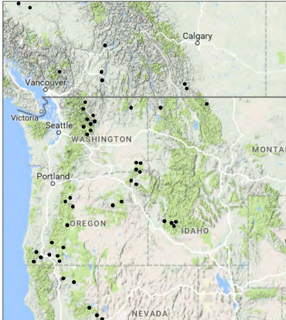
Figure 3. General locations of individual studies in the literature review database. The number of mapped sites (n=48) is less than the number of literature pieces in the database (n=75) because of the following factors: 1) some studies shared similar general locations 2) the database contains 20 review articles that cover broad geographic areas, and 3) some study locations lie beyond the map boundaries (i.e., Colorado, S. Dakota).