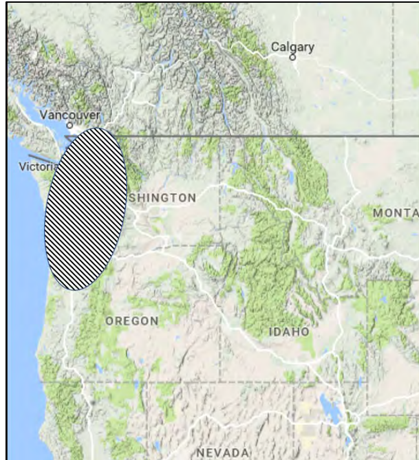
Figure 1. General geographic extent of analysis area. The literature review excluded studies occurring on the west side of the Cascade Mountains (black hatching), and included some data from applicable forest types in Colorado and South Dakota.

our analysis area that could then be consulted for region-specific information. That is, such reviews provide up-to-date summaries of the state the knowledge. Also note that, because relatively little research has been conducted on salvage logging in riparian zones per se , our literature search necessarily included salvage-related and other publications that provide useful background information to enable interpretations about potential effects of salvage logging in riparian zones. For instance, information from studies evaluating the effects of salvage logging on upland forests can often be used to make interpretations about possible effects on adjacent riparian zones. (Caution must always be used, however, when evaluating a given study's findings; that is, users are necessarily limited to drawing inferences from studies in upland terrain, and in doing so, must recognize that caveats and limitations can apply to riparian zones.)