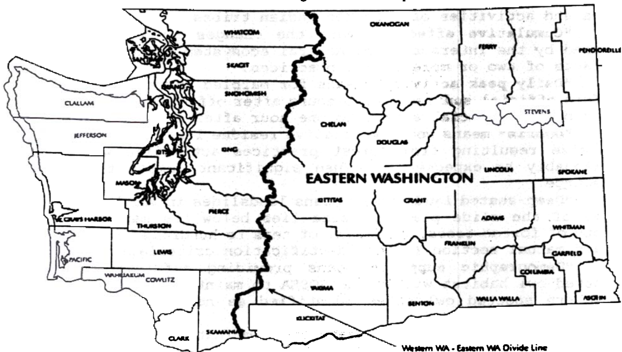
Eastern Washington Definition Map

"Eastern Washington timber habitat types" means elevation ranges associated with tree species assigned for the purpose of riparian management according to the following: